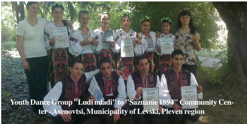
Youth Dance Group "Ludi mladi" to "Saznanie 1894" Community Center - Asenovtsi, Municipality of Levski, Pleven region