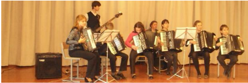
5. Folk song "The Cuckoo"

18:30 C Orchestra for Russian People Instruments at the Centre for Culture "Troitskiy" - Sankt - Petersburg, Russia